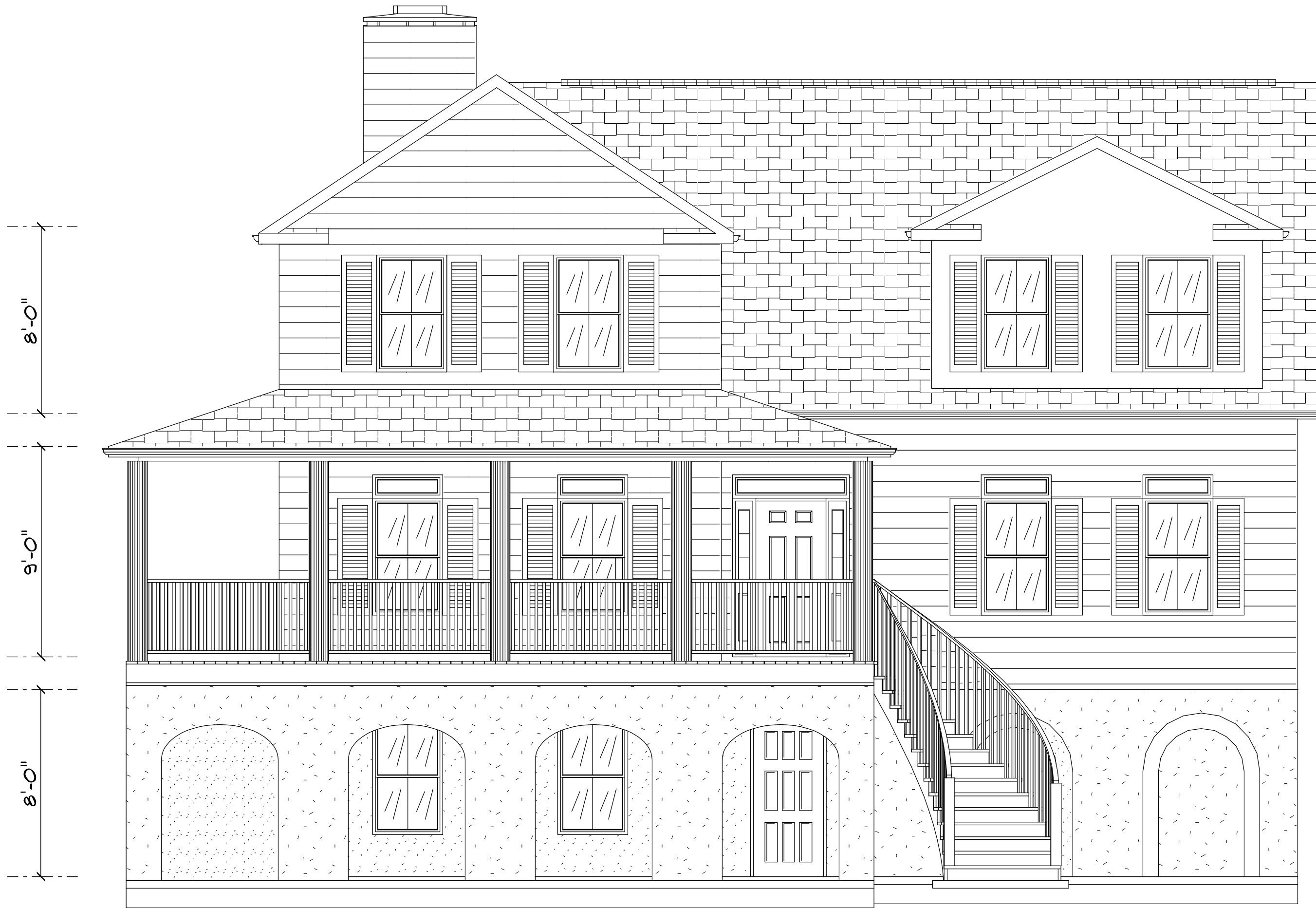
GHP-M2970 FRONT ELEVATION